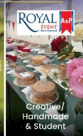
Creative/ Handmade & Student