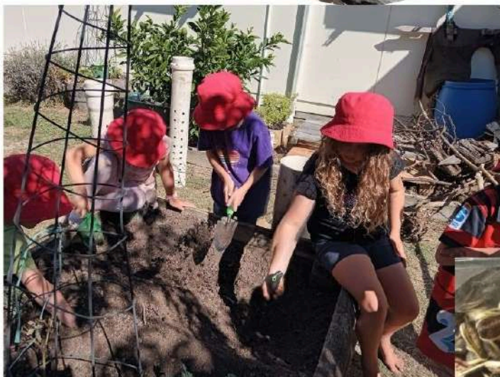
Digging to the bottom of the garden in very dry soil!!!