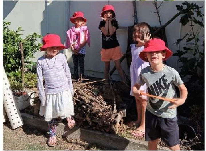
Insect motel construction

The worm farm could do with some more attention but it has some lovely worms of all sizes and some other crawlies to spot!