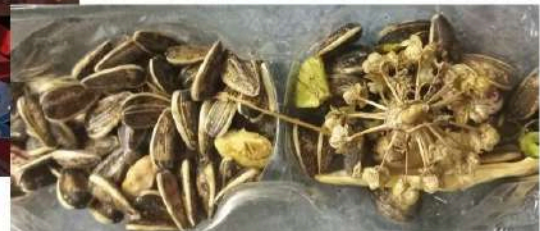
Some of our favourite seeds